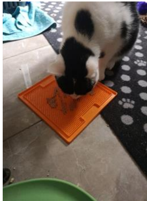
Cat Licking Food Off Silicone Tray

Hide and seek because cats use the sense of smell to find food